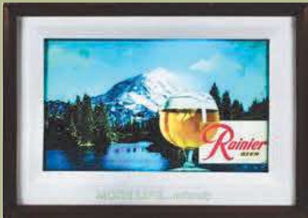
Lighted motion sign, Rainier Beer, Sicks' Rainier Brewing Co., Seattle, WA, 18.5 x 13 in., Neon Products, Inc., Lima, OH, c. 1960s.