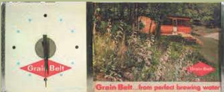
Lighted sign w/clock, Grain Belt Beer, Grain Belt Brewing Co., Minneapolis, MN, 30 x 12 in., by Tel-A-Sign, Chicago, IL, c. 1960s.