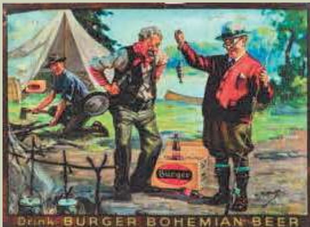
Tin-over-cardboard sign, Burger Bohemian Beer, Burger Brewing Co., Cincinnati, OH, 20 x 15 in., by American Art Works Inc., Coshocton, OH, c. late 1940s.