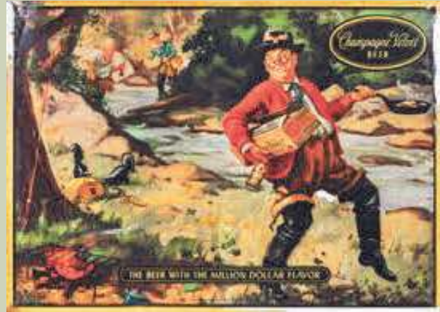
Two tin-over-cardboard signs, Champagne Velvet, Terre Haute Brewing Co., Terre Haute, IN, 19 x 14 in., by American Art Works Inc., Coshocton, OH, c. late 1940s.