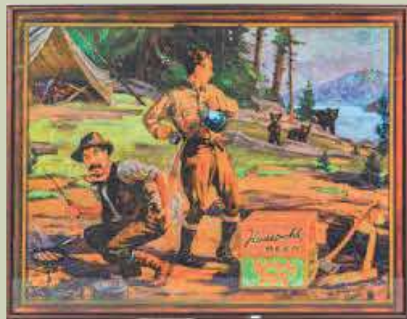
Cardboard sign, Hudepohl & Hudepohl Chevy Ale, Hudepohl Brewing Co., Cincinnati, OH, 22 x 18 in. c. 1940s.