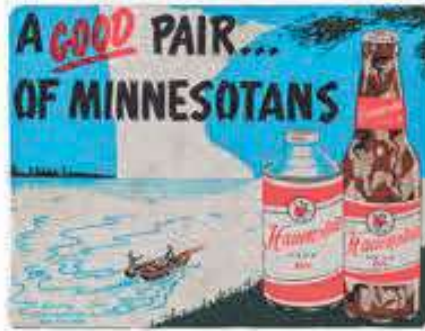
Cardboard self-erected sign, Hauenstein Beer, John Hauenstein Co., New Ulm, MN, 13.5 x 10.5 in., no mfg. mark, c. 1950s.