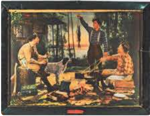
Self framed cardboard sign, Falstaff Beer, Falstaff Brewing Co., Omaha, St. Louis, New Orleans, 28 x 36 in., Simmons Sisler Co., St. Louis, MO, c. 1940s.