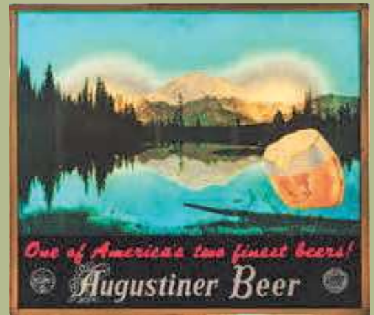
Lighted sign, Augustiner Beer, Pittsburgh Brewing Co., Pittsburgh, PA, 18 x 16 in., by Cincinnati Advertising Products, Inc., Cincinnati, OH, c. mid 1970s.