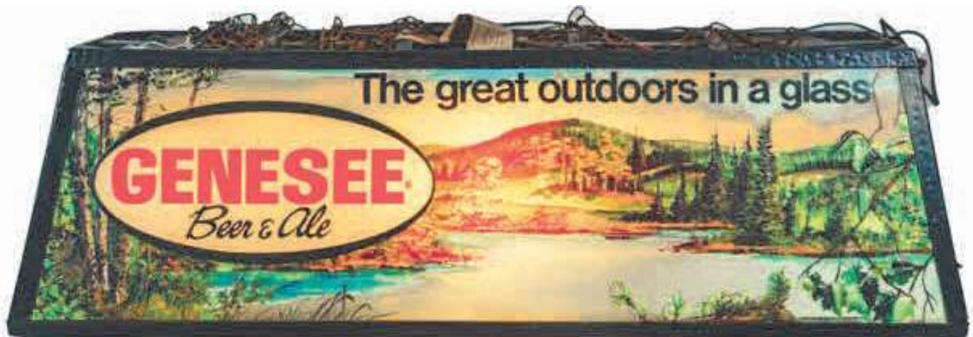
Overhead hanging light, Genesee Beer, Genesee Brewing Co., Rochester, NY, 39 x 13 in., no mfg. mark, c. 1960s.

Post-World War II advertising celebrated fishing, hunting, and camping in the “Great Outdoors”