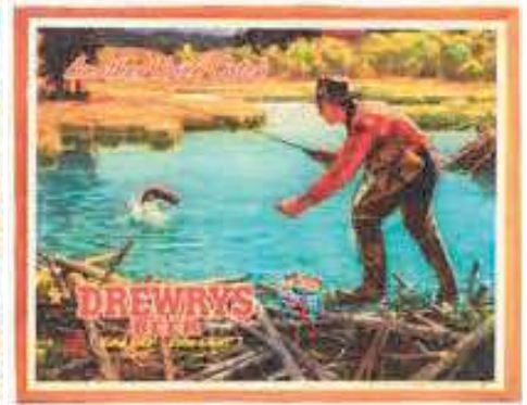
Self-framed, 14 x 11.5 in.