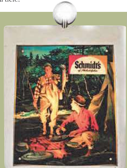
Hanging lighted sign, Schmidt's Beer, C. Schmidt & Son, Philadelphia, PA, 13.25 x 18 in., by Display Corp., Milwaukee, WI, c. early 1960s.