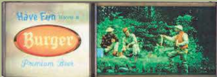
Lighted sign, Burger Beer, Burger, Cincinnati, OH, 29 x 10 in., by Neon Products Inc., Lima, OH, 1957-1963.