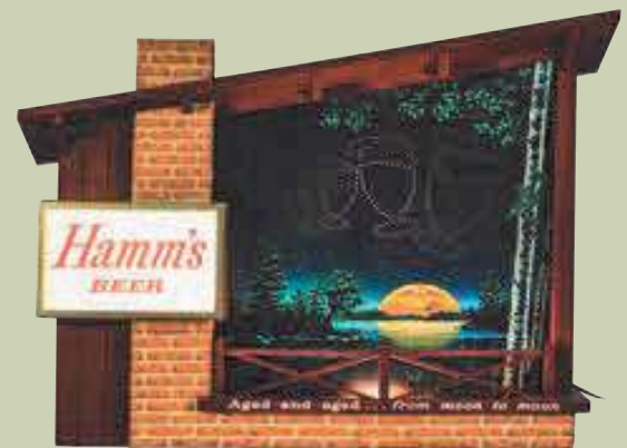
"Starry Skies with Dancing Goblets"