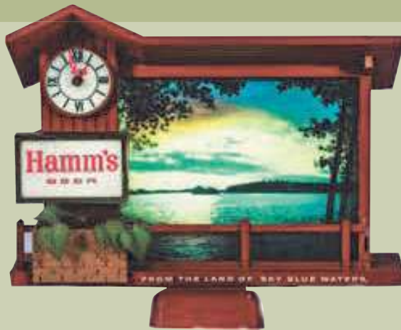
"Dusk to Dawn"