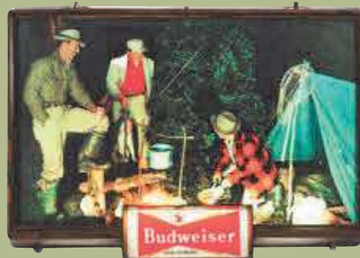
Lighted sign, Budweiser Beer, Anheuser Busch, St. Louis, MO, 20 x 13 in., Raymond M. Price & Assc's, Chesterton, IN, c. 1950s.