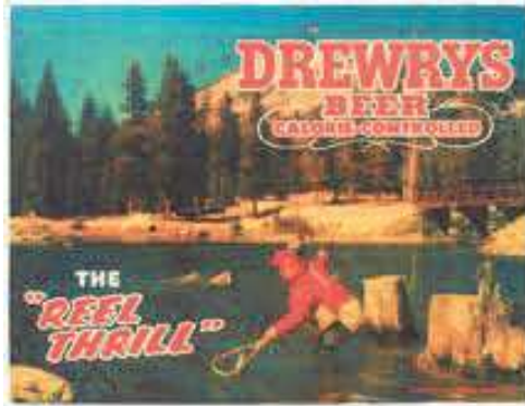
15 x 11 in.