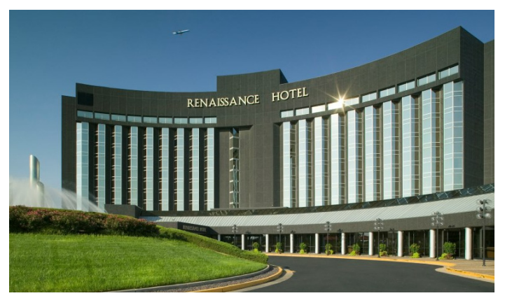
The 2024 NABA Convention will be held at the Renaissance St. Louis Airport Hotel in St. Louis, MO.