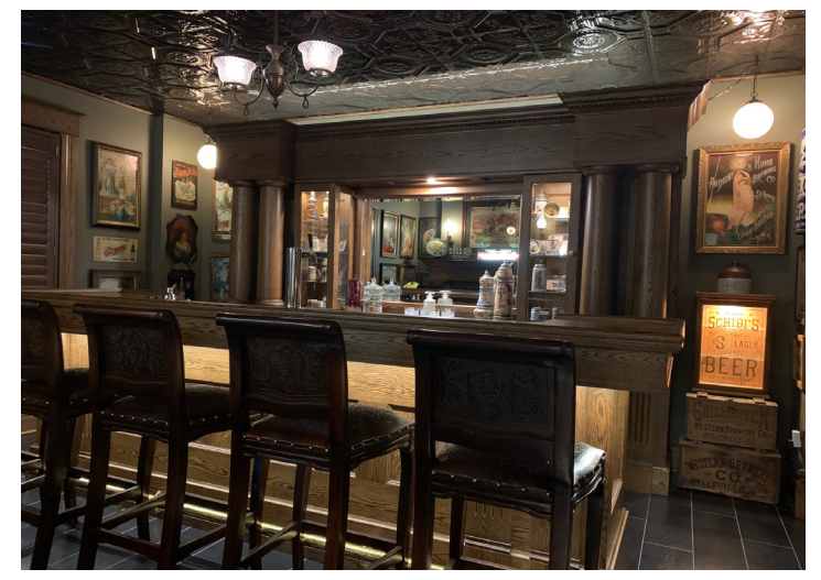
Dave Birk's beautiful home features a remarkable collection of lithographs and etched glasses, presented in an unforgettable speakeasy setting.