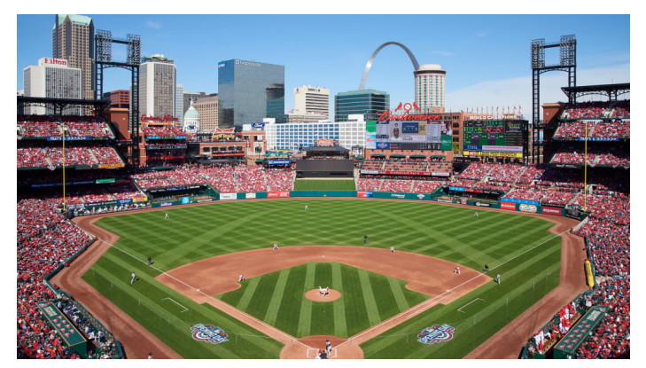
Monday night baseball will feature the St. Louis Cardinals hosting the Texas Rangers. Tickets for the NABA block of seats are limited and can be ordered only via the NABA website www.nababrew.com .

NABA has secured a block of discounted tickets which are available for purchase directly by going to our website, www.nababrew.com on a first come, first served basis. Convention registration is required to purchase tickets from the NABA block, and members will need to provide their own transportation to and from Busch Stadium.